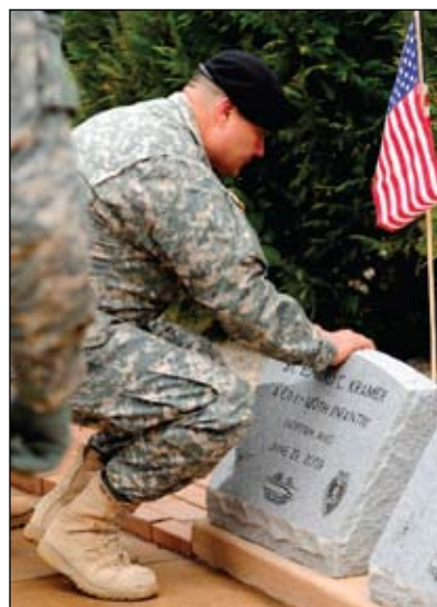
A North Carolina National Guard Soldier touches one of four new stones after the rededication ceremony for the Fallen Soldiers Memorial Garden at the 120 th Combined Arms Battalion Headquarters in Wilmington, NC. The memorial garden is a place where soldiers and families can come to remember the fallen Soldiers who are honored here.

Families, fellow Soldiers, police and so many others filed past. Some saluted, some hugged, some cried; all mourned.