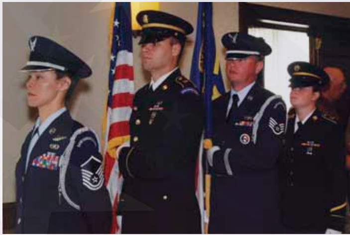
NC Air Guard Color Guard opens the 50 th Annual NCGA Convention.