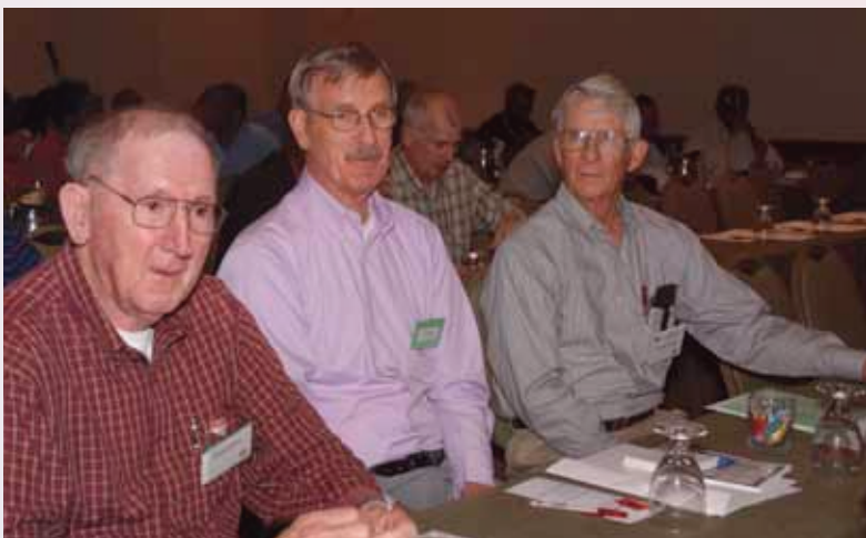
A few of the Business Session attendees.