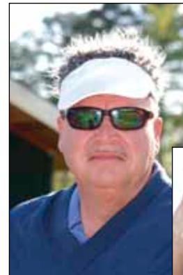
Seen At the Golf Tournament