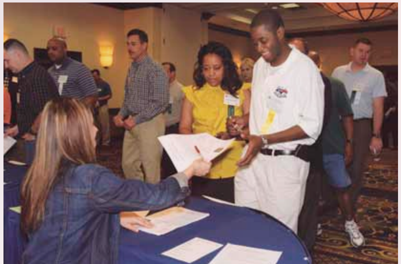
VOTING — First you get your ballot (right), then (below) you lean on wall and complete the ballot, and once complete you put your ballot in the box being manned by the Nominating & Credentials Committee members. Ballots are then counted; amendments are approved/disapproved and new Council members are elected.