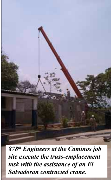
878 th Engineers at the Caminos job site execute the truss-emplacement task with the assistance of an El Salvadoran contracted crane.