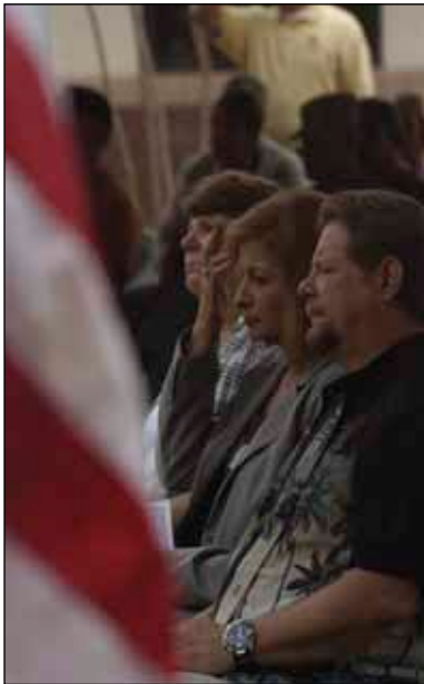
Family members listen as their Soldiers are remembered at the 1 st Combined Arms Battalion, 252 nd Armor Regiment Fallen Soldier Memorial Ceremony.

The memorial centerpiece is a replica of T-Walls, large concrete walls used in Iraq to protect against attack, with a bronze plaque