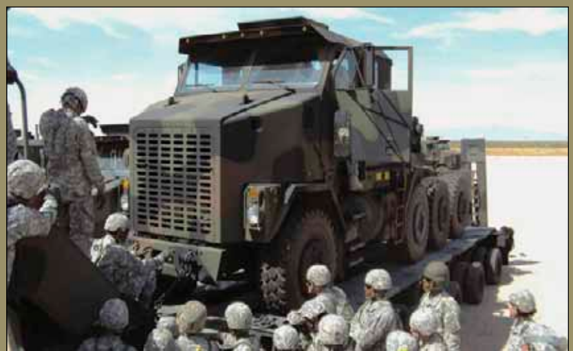
Staff Sergeant Derrell Wiggins, 1 st Platoon, 1452 nd HET Company, 113 th Sustainment Brigade, instructs fellow Soldiers on heavy equipment loading procedures at Camp McGregor, Ft. Bliss, Texas.

The temperature drops to a "cool" 85 degrees as the hot sun sinks below the desert floor. The Soldiers of the 1452 nd take a well deserved break from training and relax and eat their dinner. "Tonight is going to be exciting," stated Sergeant Sergio High, from Mount Pleasant, NC. "We'll be conducting night fire qualification on our vehicle mounted weapons systems, and after this we are one step closer to going downrange." The 1452 nd is scheduled to deploy this fall.