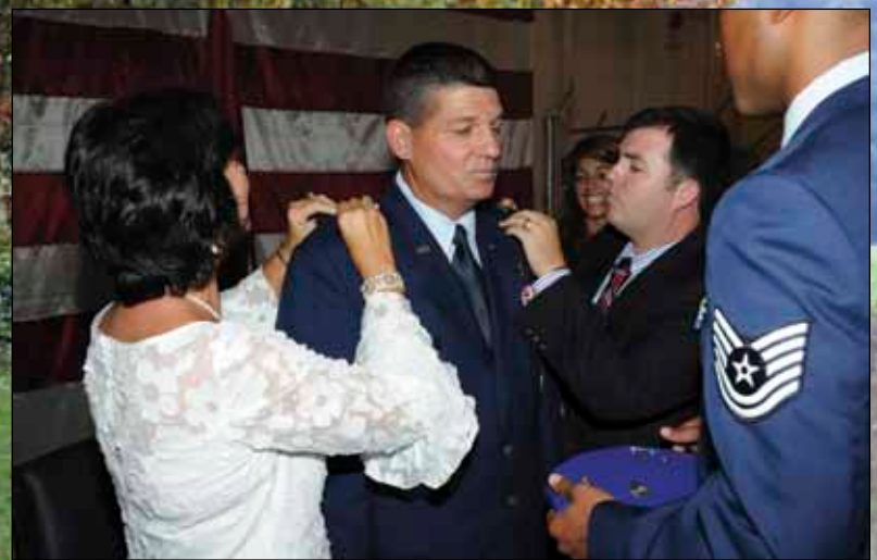
New Air Guard General (see page 4)