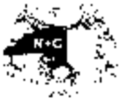
Exhibit Space Application

North Carolina National Guard Association